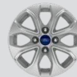
14" Alloy wheel – 175/65 R14 Available on Trend model