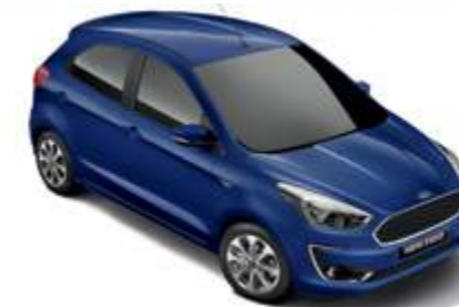
Deep Impact Blue (Metallic*)