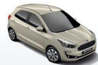
White Gold (Metallic*)

*Metallic body colours are options at extra cost.