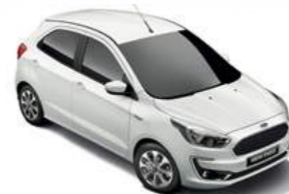
Oxford White (Solid)