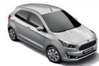
Moondust Silver (Metallic*)