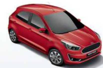
Ruby Red (Metallic*)