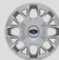
14" Steel wheel cover – 175/65 R14 Available on Ambiente model