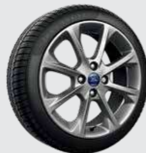
Titanium model: 17" Alloy 205/45 R17