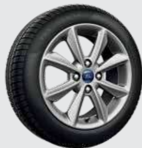
Trend model: 16" Alloy 195/55 R16