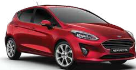
Ruby Red* Tinted clearcoat