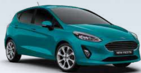
Blue Wave* Tinted clearcoat